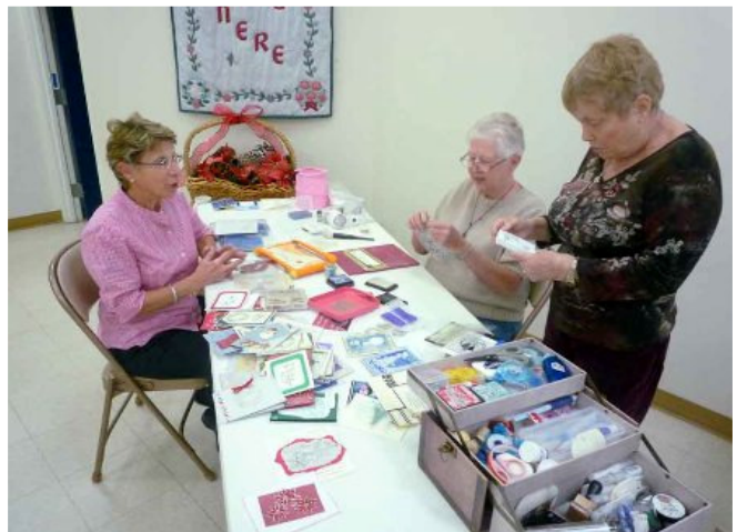
Our newly formed Greeting Card Ministry met on December 12 and started preparing cards.