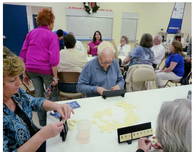
We ended the month and 2011 with snacks, games, and fellowship as we ushered in the New Year together!