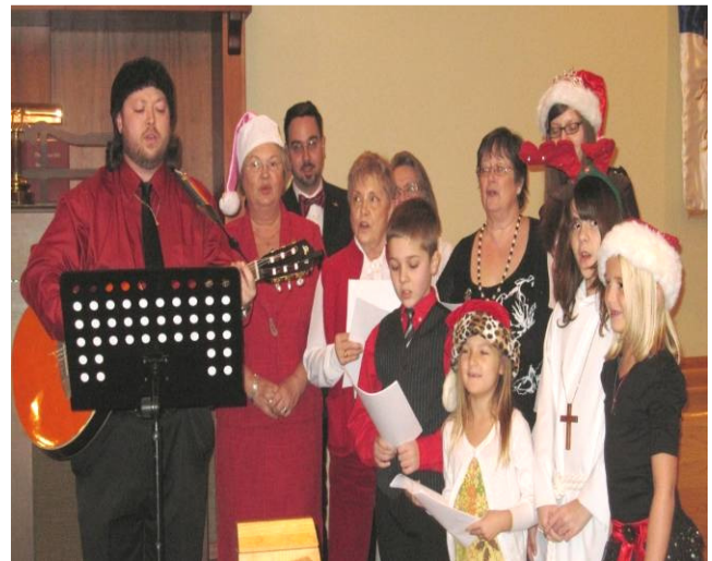
The children and youth’s music was a special highlight on Christmas Eve ...