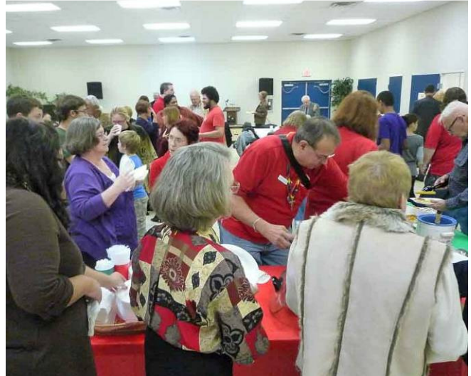
. . . and then we gathered to enjoy our traditional "tamale & trimmings" luncheon.