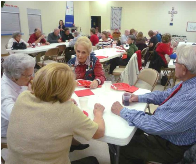
We had a “Sing Along” Game Night on Friday, December 16 th ...