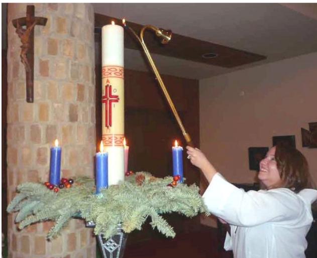
... and Christmas Day we gathered to worship and celebrate the birth of Christ.