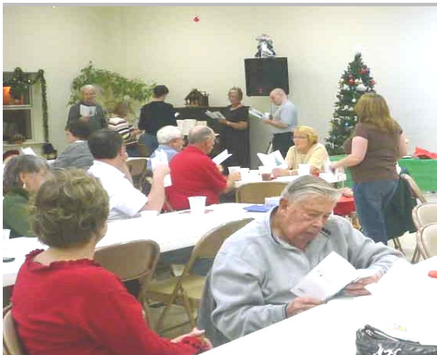
... and then join them singing Christmas Carols.